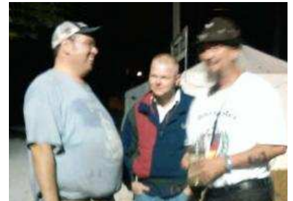
The 3 stooges